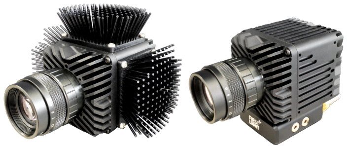
Passive heat sinks (left) and hydraulic cooling plate (right)